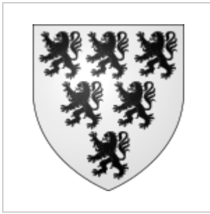
Arms of Savage: Argent, six lions rampant, sable [4][17]